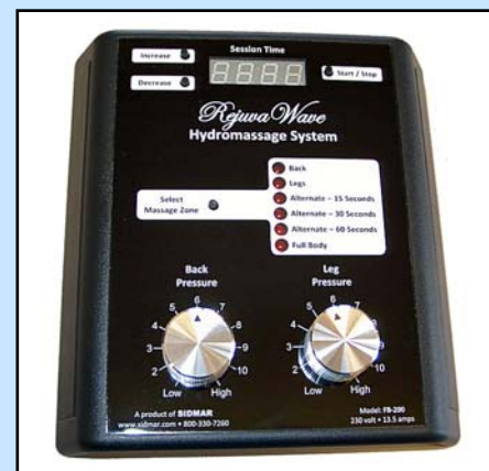
FB200 Control: Back, Leg, Full Body or Alternating